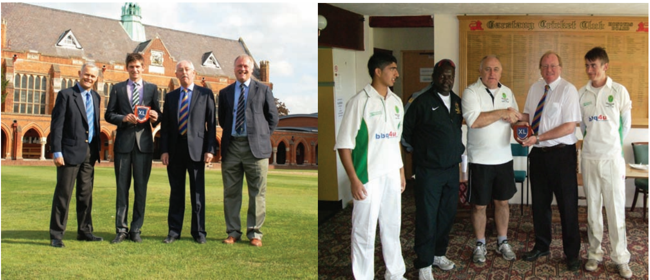
Pictured above two Forty Club District Awards, St John's Leatherhead on the left and Myerscough College