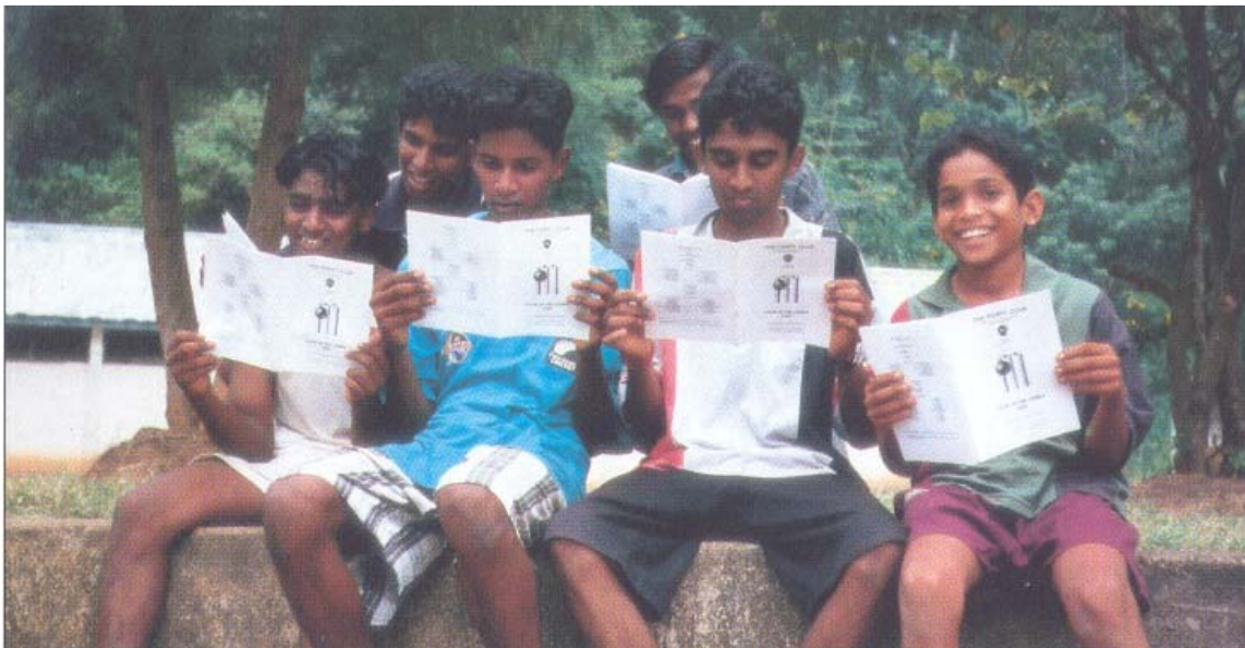
The Tour Brochure proves popular

Thursday March 4. A rival at Heathrow. The snow had cleared. Only 44 days to the next XL fixture.