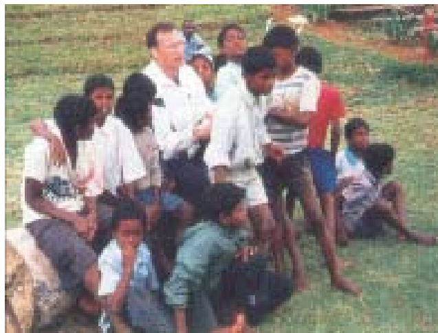
Time for a break at Badella