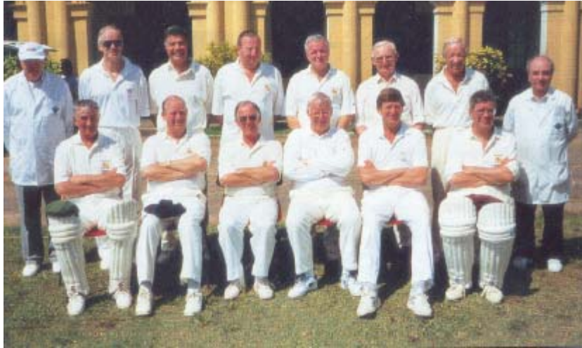
The XL 12 that faced the Prince of Wales College