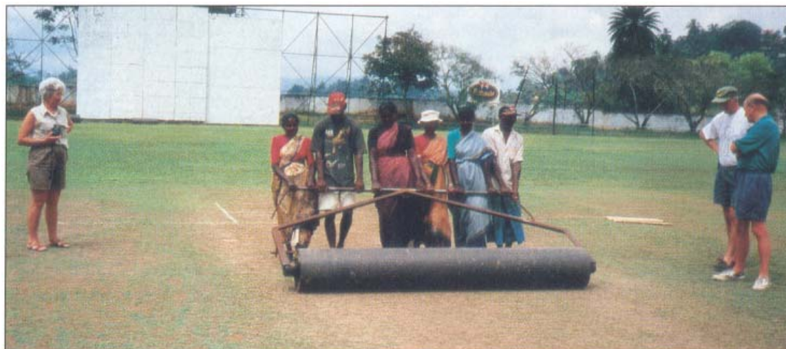
Rolling the pitch at Kandy's Test ground