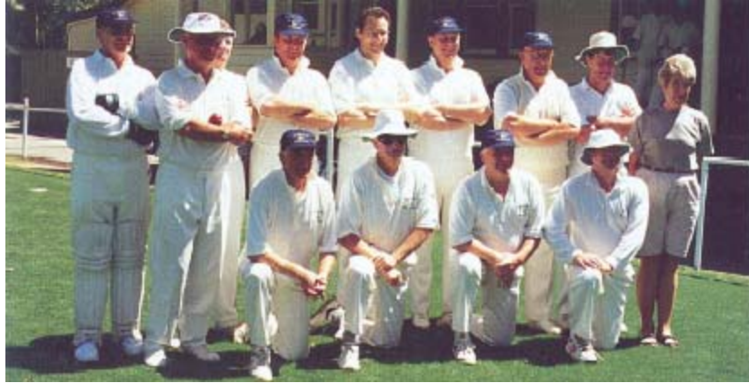
The victorious side against the Melbourne CC 29ers