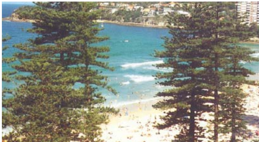
A view of Manly Beach, one of Australia's finest. We were quartered there in the Sydney leg