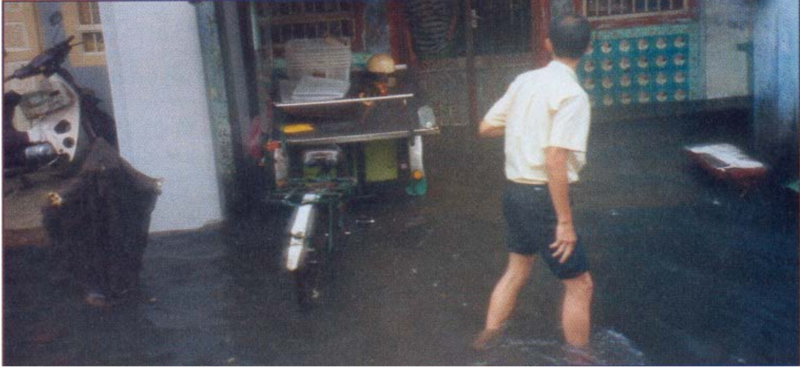
Flood stops play!

October 25 – Unfortunately a match against a strong Malaysian U19 was aborted by the rain. The boys reached 265-6 in their 40 overs mainly by aiming for sixes. That provided for extra practice for the XL veterans who dropped thirteen catches. Is that a XL record? XL were 44-0 after 12 overs, primed to... well, it might have been a glorious victory.