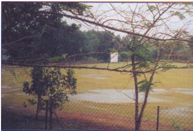
Penang Sports Club flooded again!