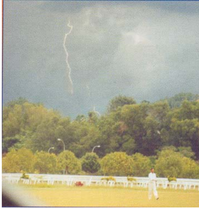
Lightning strikes at the Royal Selangor Club