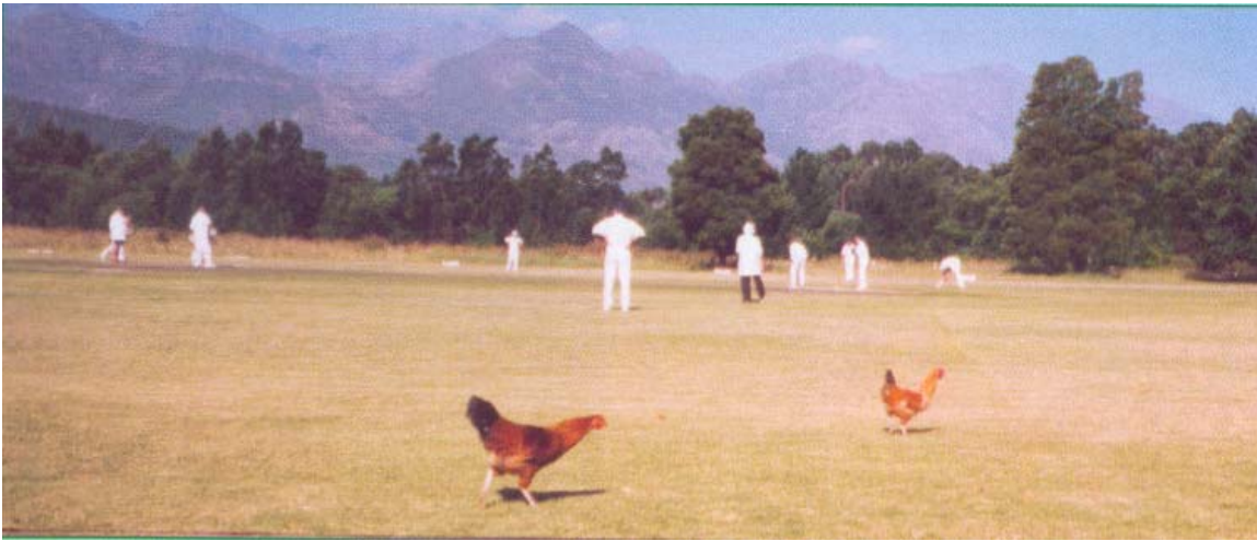
Two extra fielders take the field at Groot Draktenstein CC