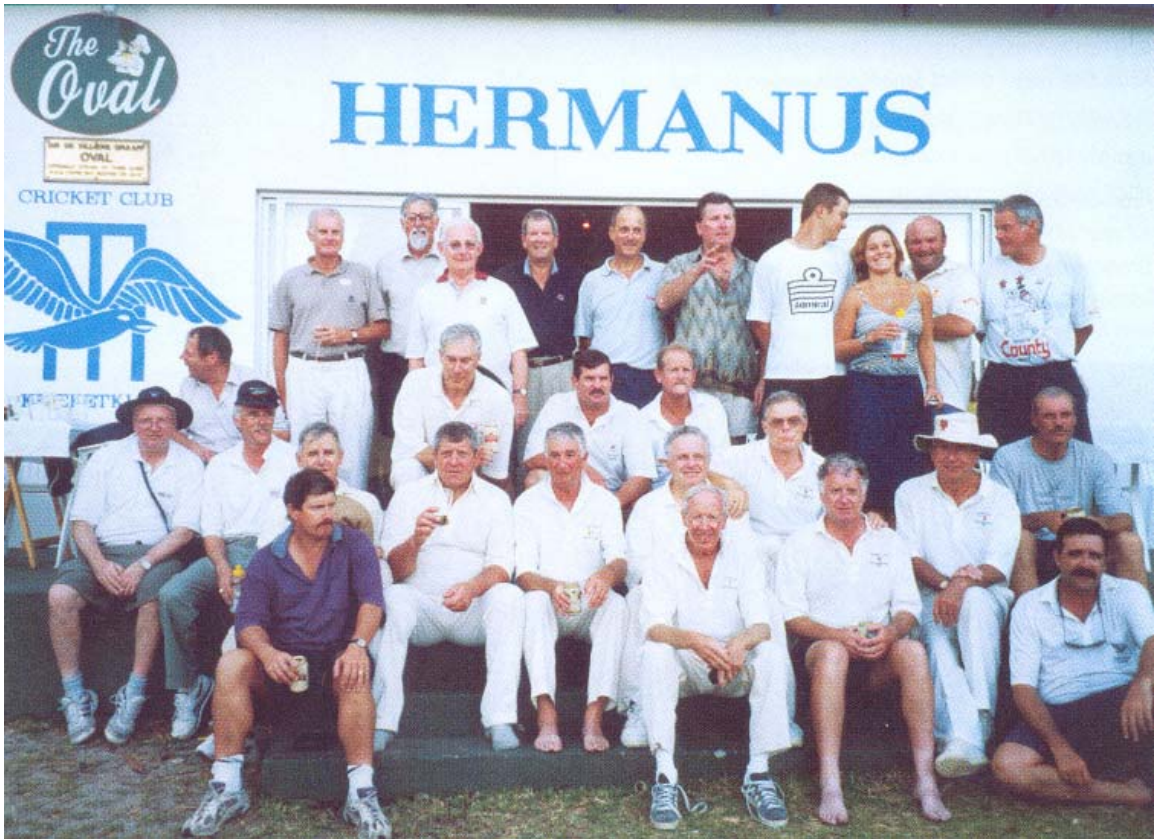
Another defeat ...but still smiling.