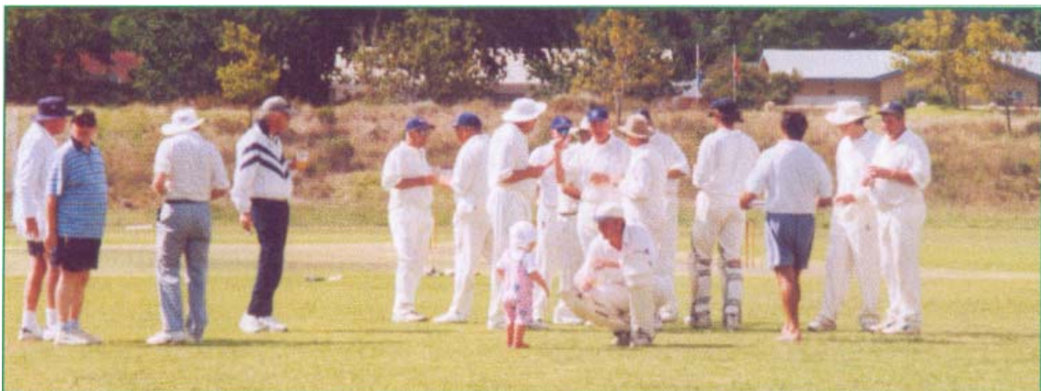
The home side was much younger!